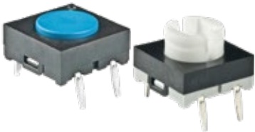
Changes for JB Series Low Profile Tactile Switches

There will be changes to the top of the switch case for specific JB Series low profile process sealed tactiles. The top of the case has a round concave impression in one of the corners, and an identical impression will be added in the diagonal corner of the case. This revision will apply to nonilluminated models with a flat blue button or short actuator, with straight PC terminals, and to illuminated models with a short actuator. Both categories will include standard and custom part numbers. Effected standard part numbers are displayed on page 2.