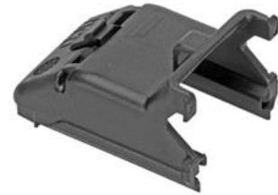
CMC 48w wire cap