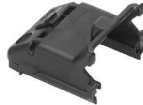
CMC 32w wire cap