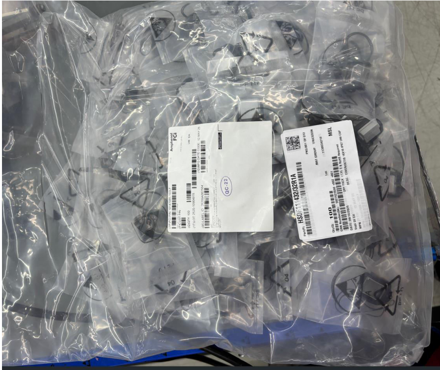
Bulk Package-Existing Packaging Packing Quantity:500 Nos/Box