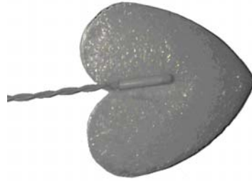
Sensor & Tempheart