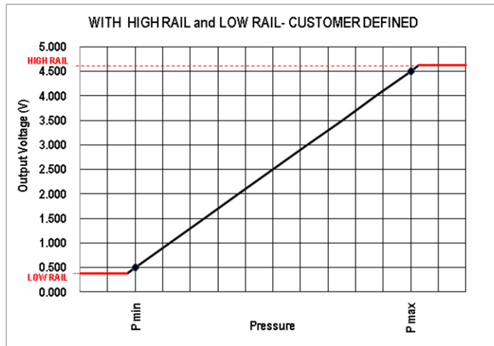
OEM Custom Calibration High/Low Rail values can be adjusted by circuit