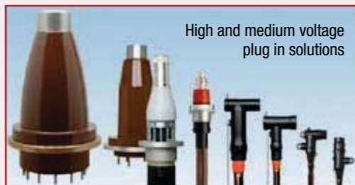
High and medium voltage plug in solutions

Power demand is increasing worldwide yet existing installation space remains the same. This leads to higher requirements when it comes to power density of grids and associated electrical connections. Separable plug-in solutions are increasingly becoming established in distribution and transmission applications to meet this challenge. This is because of the benefits offered compared to standard air or oil-insulated terminations and unscreened separable connection systems. Moreover, there is an ongoing evolution of these plug-in solutions and modern separable connection systems offer much higher performance to meet the growing requirements of present-day power grids. ☒