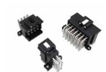
Unsealed AMP MCP