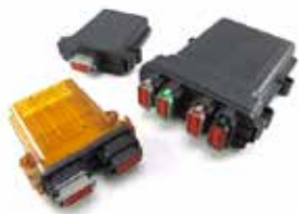
DEUTSCH Sealed PCB Enclosures and Headers Page 14