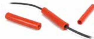
Jiffy Splices Page 14