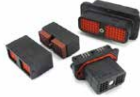
DEUTSCH DRC Page 10