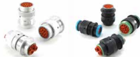
DEUTSCH HD30 and HDP20 Page 13