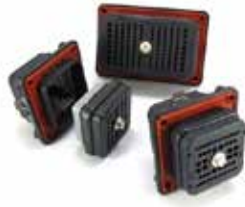
DEUTSCH DRB Page 10