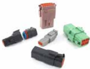
DEUTSCH DT Page 11