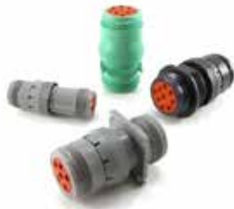
DEUTSCH HD10 Page 12