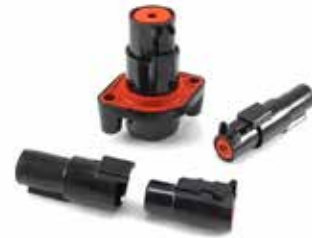
DEUTSCH DTHD Page 12