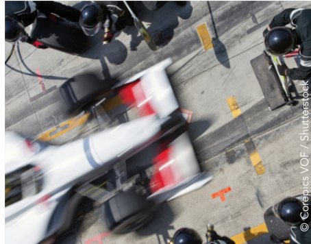
Data Acquisition System