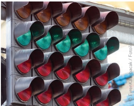
Telemetry & Network