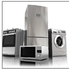
Home appliance (white goods)