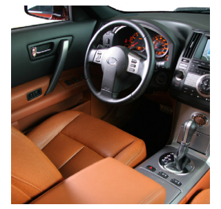
White Goods Infotainment