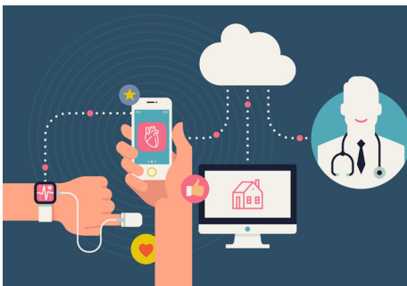
Fig. 1 - Diagnostics, therapeutics, and medical monitoring modalities have set the stage for connected wearable medical devices.

The acceptance of home-use medical monitoring technology is driving the expansion of these devices to also provide therapeutic relief, shifting therapy from the clinic setting to the on-patient ecosystem.