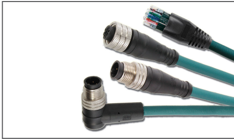
Double-ended cordsets offer engineers and designers a variety of different connectors to place on each end of the cordset.

Mainstay M12 connectors: About 80% or more of the connectors used in machine applications are a variant of M12. It offers the best balance between size, performance, and handling. Smaller M5 and M8 connectors are generally more fragile, so they tend to be used only in extremely space-constrained low-power and signal applications such as sensors.