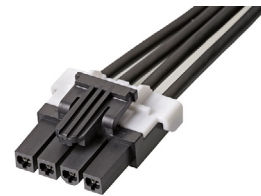
Mini-Fit TPA Single-Row 4-Circuit Cable Assembly