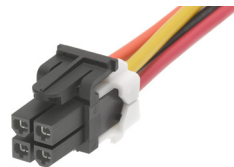
Mini-Fit TPA Dual-Row 4-Circuit Cable Assembly