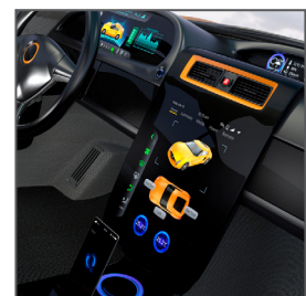
Automotive: Inside Devices