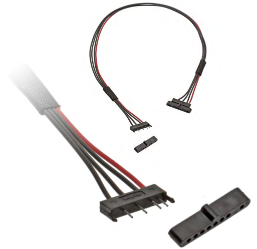
Steering Column Harness