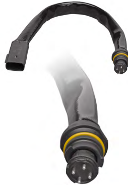
Smart Remote Actuator Harness