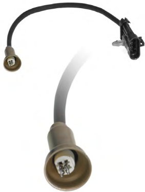
Oxygen Sensor Harness