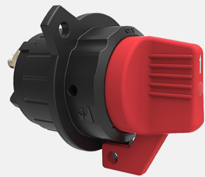
BD-Series Battery Disconnect

1-2 Poles 2 (1/2 throw) or 3 (full throw) Positions 10A 28VDC 4 Legend Orientation Choices 10 Terminal Base