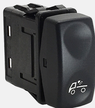
S-Series Bezel-less Rockers

1 Pole 2 or 3 Positions Sealing Protection .4A 28VDC Built in PCB