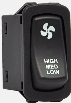
N-Series Sealed Addressable Rockers

1-2 Poles 2 or 3 Positions Sealing Protection 20A 12V Up to 10 Terminals