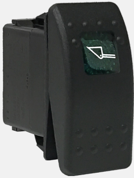
V-Series Contura® Sealed Rockers

Snap-in rocker switches with removable actuators in a variety of styles. Countless options for circuits, illumination & legends.