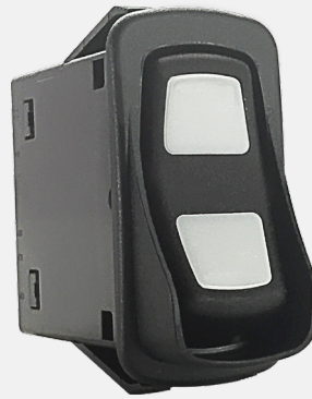
L-Series Sealed Rockers

1-2 Poles 2 or 3 Positions Sealing Protection 15/20A, 12/24VDC; 10/15A, 125/250VAC Up to 10 Terminals