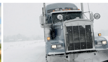
TRUCK AND BUS