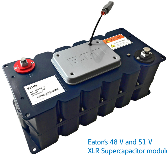
Eaton's 48 V and 51 V XLR Supercapacitor module is UN ECE R100 qualified

With so many varied lines of inductors for any feasible application, Eaton's power components are the optimal choice for the automotive industry. As vehicles inch closer and closer to full electrification, Eaton's products will follow suit, adapting to both under-the-hood and passenger needs as they arise, evolve, and progress.