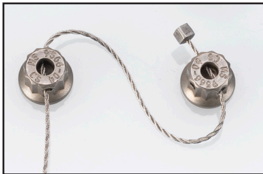
Step 1 - Thread

A cable assembly is threaded through the fasteners in a direction that exerts a positive pull on the fastener when tension is applied.