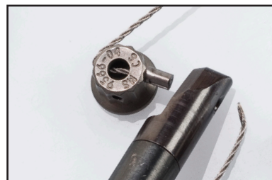
Step 4 - Crimp & Cut

The ferrule is firmly crimped and the cable is cut flush with the end of the ferrule.