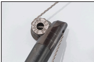
Step 3 Tension

Simply thread the cable through the ferrule and the tool nose.