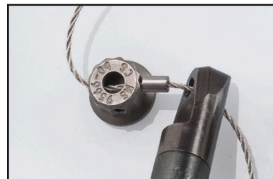
Step 2 - Insert

A cable assembly is threaded through the fasteners in a direction that exerts a positive pull on the fastener when tension is applied.