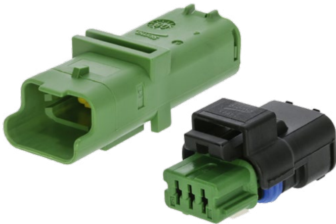
SICMA Mini-Sealed Connectors