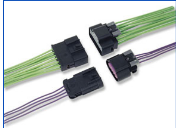
GT 150, 280, and 630 Series