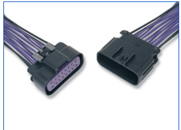
GT Mixed Series