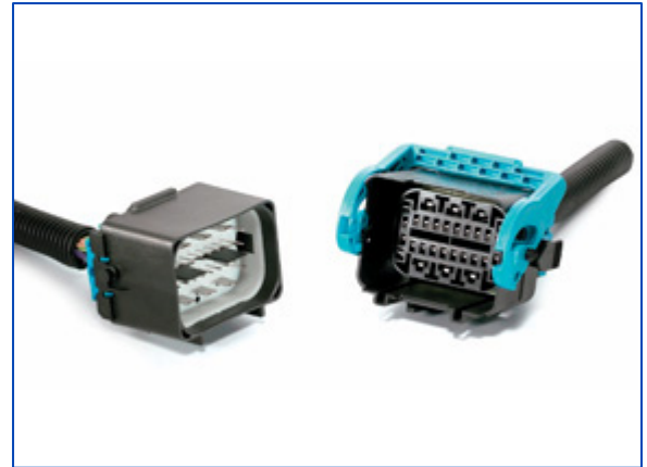
GT Lever Lock Series