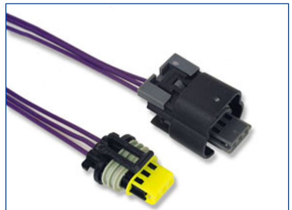
GT 150 Female Sealed (3.5 mm Centerline)