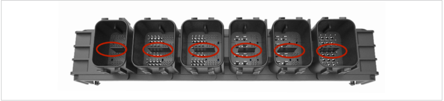
Figure 4: Koshiri design and guidance ribs

In addition, with the increase in sensor-driven interdependent ADAS and automated driving functions, these hybrid connections will increasingly also need to support data connections. These could include coaxial and differential connections for cameras, sensors as well as ECU networking.