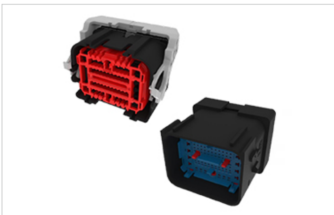
Figure 3: Generation Y 68P Sealed Hybrid Inline Connector. Generation Y 0.64 mm and MATE-AX Mini Coax Connector for applications where separate low voltage power and signal connectors run alongside traditional data connectivity. Typical applications include high-resolution cameras and displays, antenna connections, transfer of video and sensor signals. Learn more.

The above would require new a high-speed communication network moving away from legacy bus architectures to a modern Ethernet-based backbone. In addition to the reduction