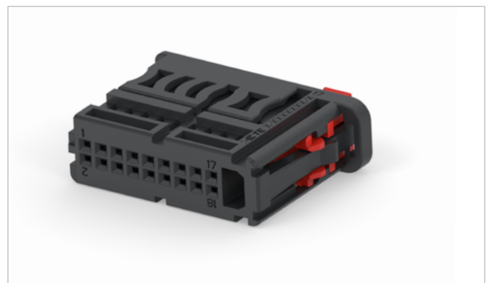
Figure 6: TE Connectivity NanoMQS 18 position connector housing