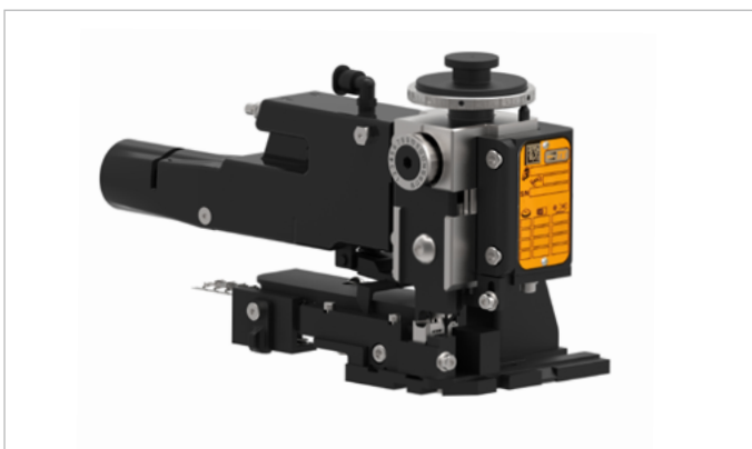
Figure 5: TE Connectivity OCEAN 2 Applicator

It is therefore highly desirable to minimize the amount of manual work in the wire harness assembly processes in order to eliminate or minimize potential sources of error. One example is “block-loading” which involves the automated