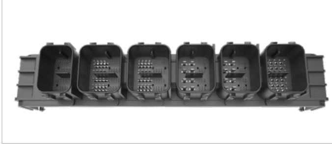
Figure 2: 254 Position hybrid header for an engine management ECU: 160 x NanoMQS (0.5 mm), 78 x MCON 1.2 mm, 16 x AMP MCP 2.8 mm (example).

into highly powerful centralized platforms. These will feature a reduced number of software instances with richer multi-functional functionality that can support an increasing number of interdependent automated driving functions.