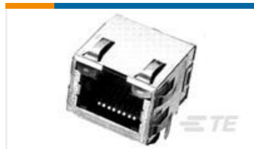
TE Part #2-406549-8 IMJ,1X1,PNL GRD,LED(YG/YG), SN