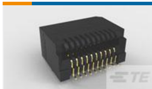
TE Part #1367073-1 20 POS SMT CONN, SFP, 15AU