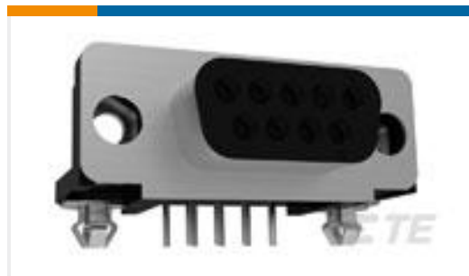
TE Part #5747844-4 09 MSFL RCPT RA 318 (IN,FM,BL)