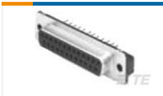
TE Part #5747150-8 09 RCPT SP/FMS INSRT