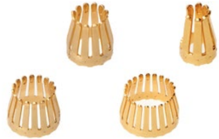
-Coeur Socket Technology

incorporates conical sockets to ensure a large conductive surface area. This reduces contact resistance and voltage drop to minimize heat generation and deliver high-current carrying capacity. And the cable-side exit configuration uses minimal space, enhancing efficiency and design flexibility.