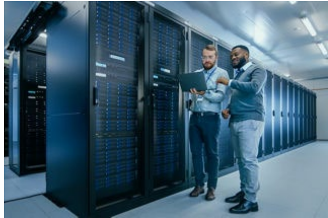
Data centers require ever-greater power and speed.

The demand for high-power cable assemblies reflects the continual evolution and massive influence of The Internet of Things (IoT), cloud computing, and 5G wireless, all of which require ever-greater data speeds and bandwidth. Data centers serve as the hub of the internet, providing the infrastructure and services that enable businesses and individuals to communicate, store, and access data.