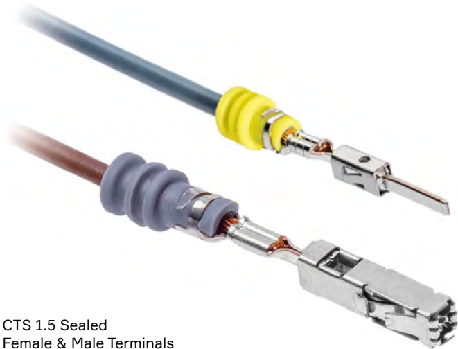
CTS 1.5 Sealed Female & Male Terminals